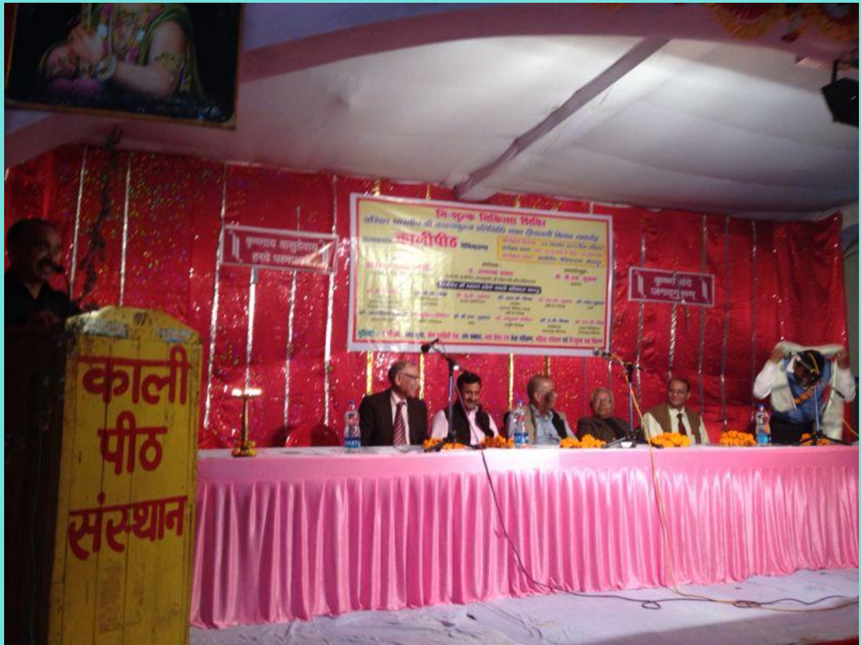
Meeting of the Kanyakubj Sabha