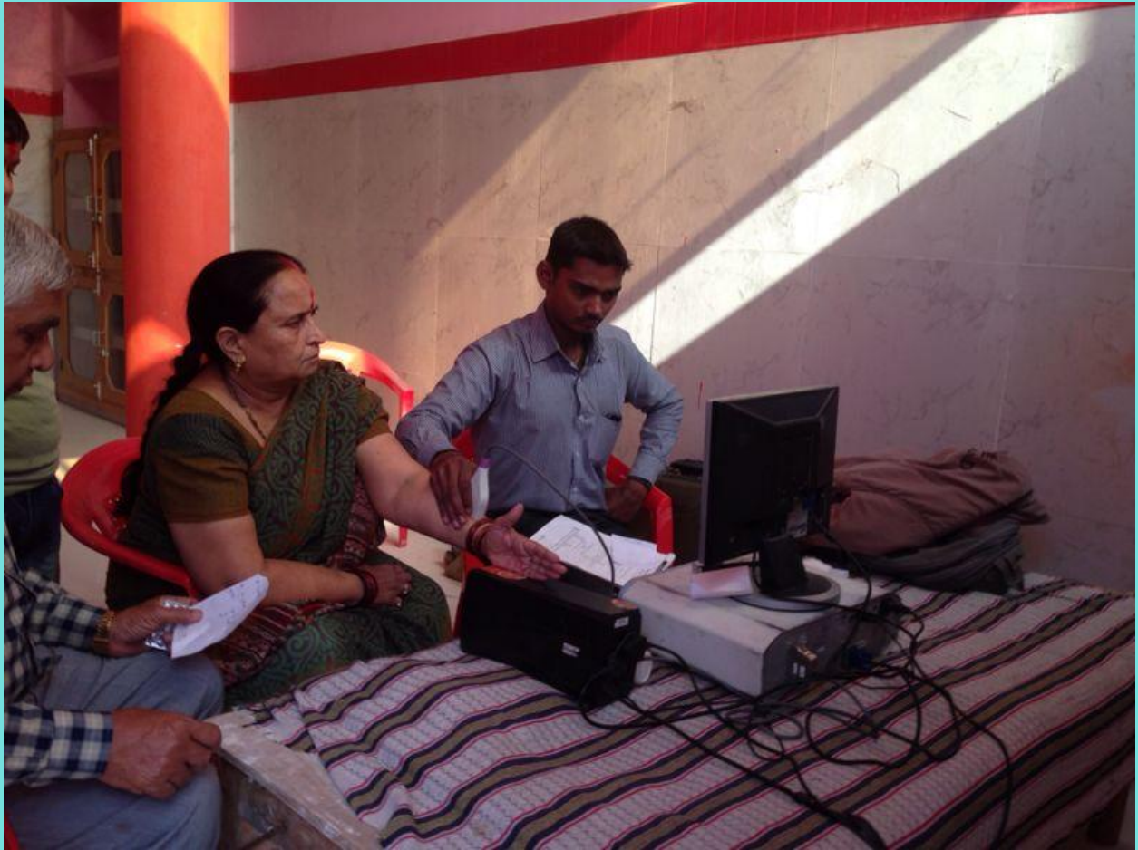
Bone Density Test